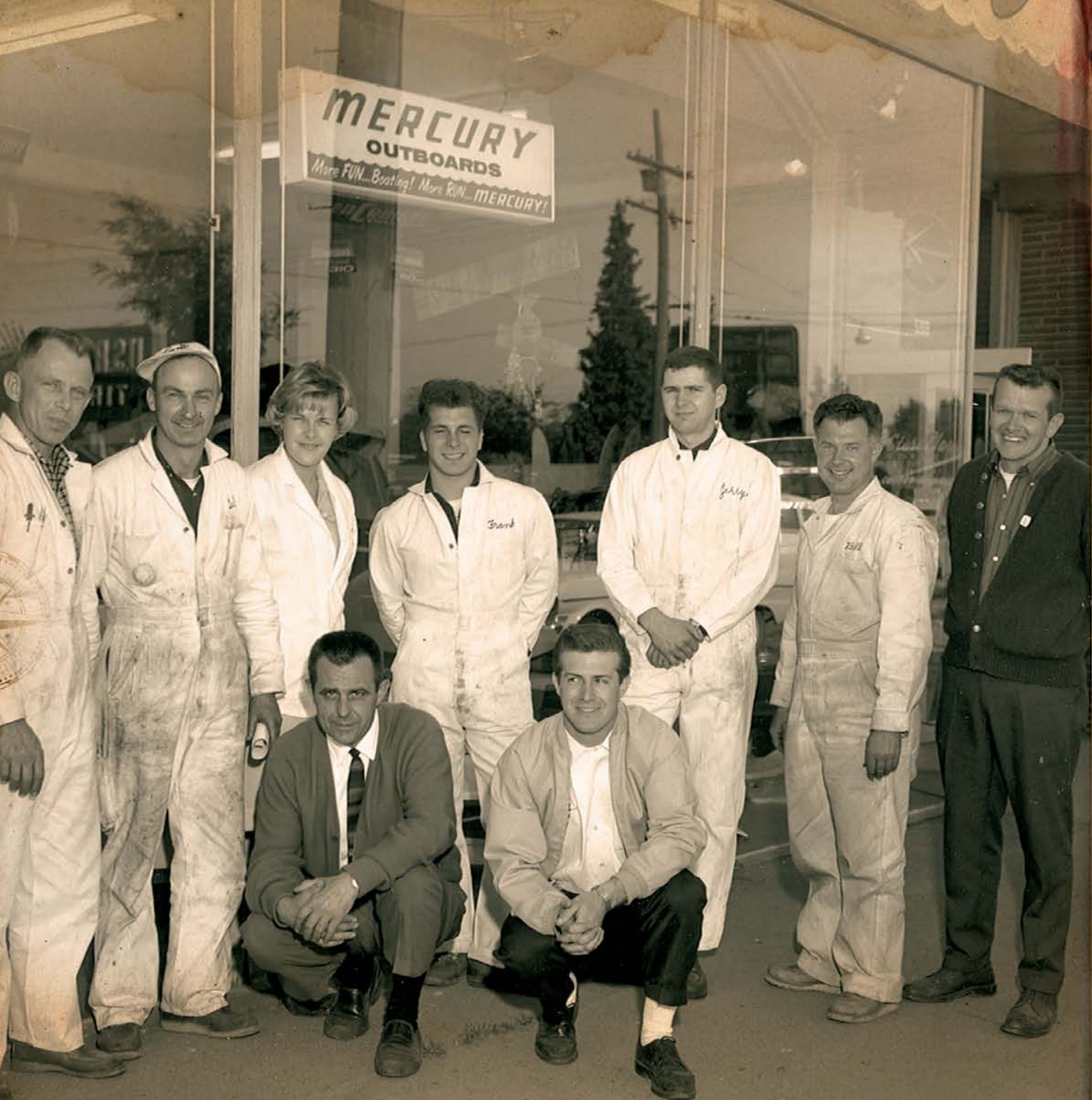
A staff photo outside the Advanced Outboard Marine showroom in Seattle, which opened its doors in 1958.